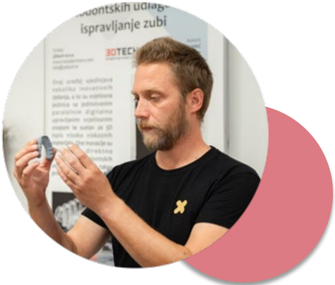
Build your product

Build and scale your company with our community of co-founders. Get access to talent, expert advisors, capital, and expansion support worldwide.