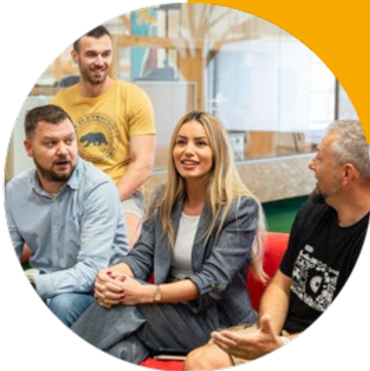
Join our community