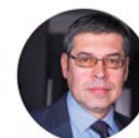
Zvonimir Oreč Market Entry / Business Strategy and Planning